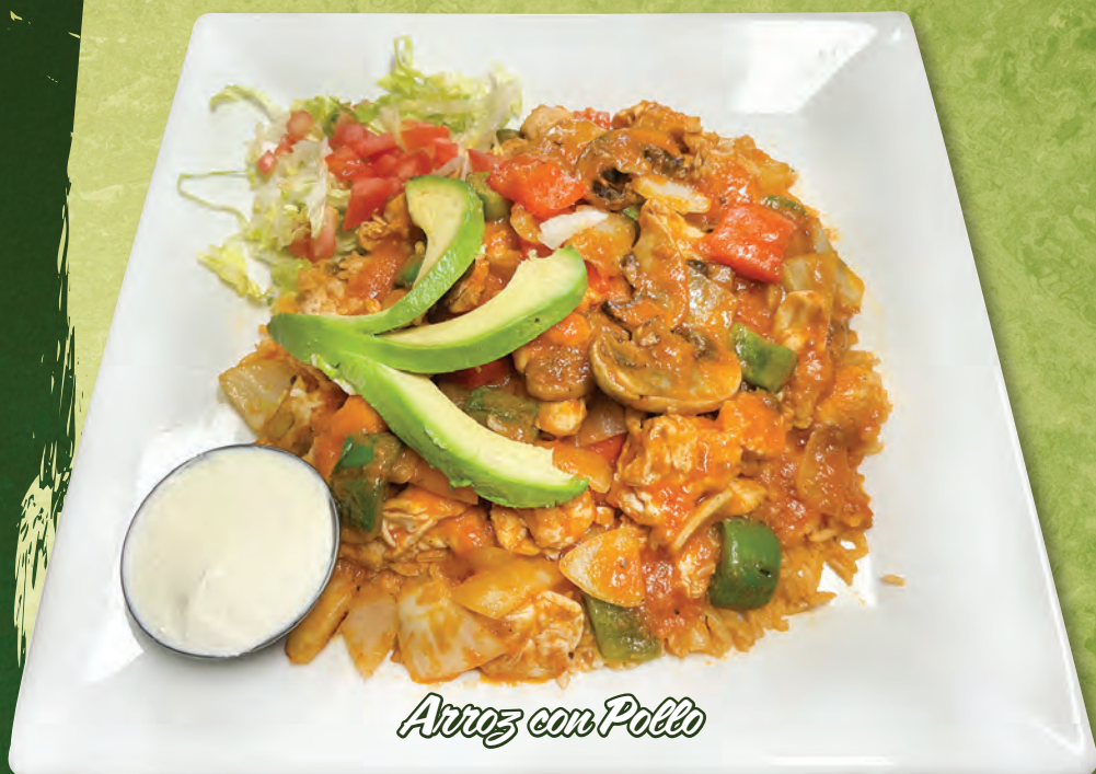
Arroz con Pollo

*These items can be served raw or undercooked. *Consuming raw or undercooked meats, poultry, seafood, shellfish or eggs may increase your risk of foodborne illness. Before placing your order, please inform your server if anyone in your party has a food allergy. GF: Gluten Free **Prices may vary.