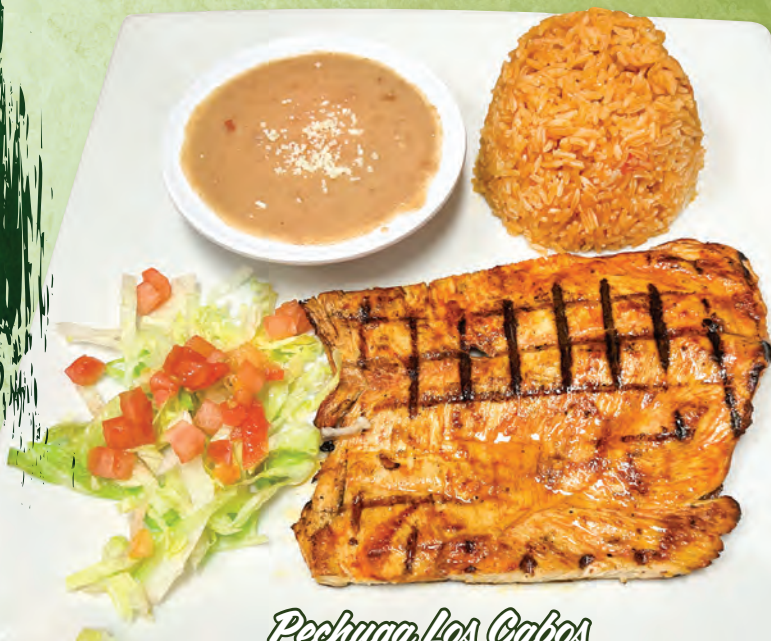
Pechuga Los Cabos

Sliced chicken breast sautéed in our sour cream sauce with mushrooms. Served with rice and beans.