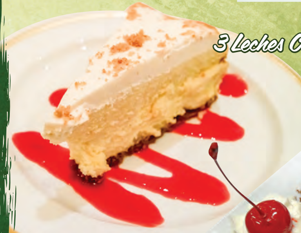
3 Leches Cake