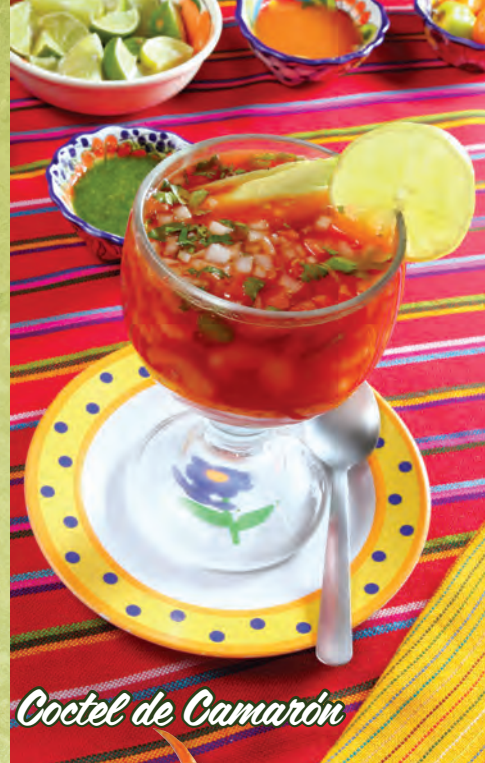
Coctel de Camarón