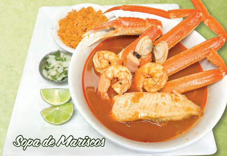
Sopa de Mariscos