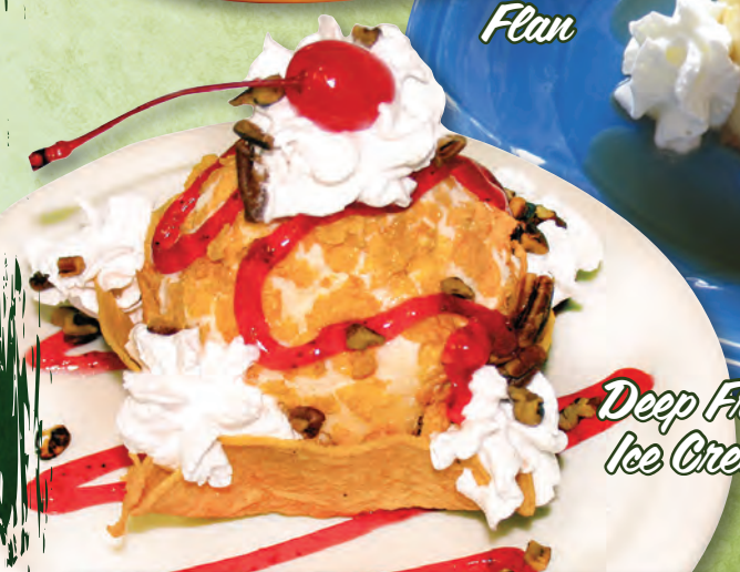
Deep Fried Ice Cream