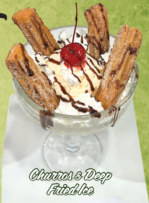
Churros & Deep Fried Ice